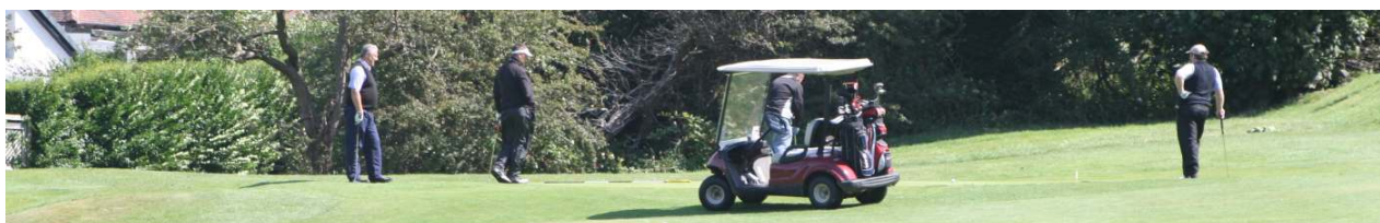
As you can see, the sun finally came out ☺

Congratulations to all the winners of the prizes on the day.