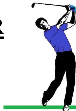
The WAGS 2018 Away Weekend Overall Championship Table