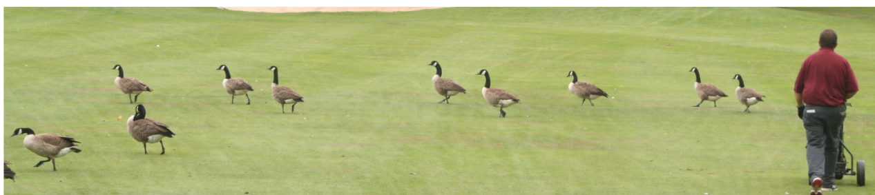
One Man and His Goose.....